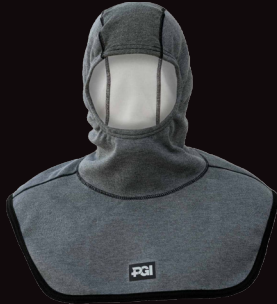
PGI BarriAire Silver