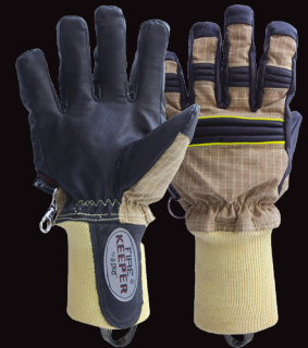
Asko Fire Keeper