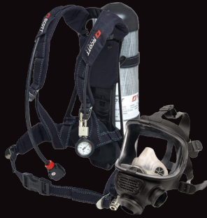
Scott Safety ProPak