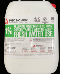
Phos-Chek 1% FF Class A/B