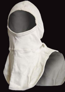
Stewart & Heaton Nomex Blend