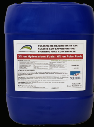
Solberg Re-Healing Class B