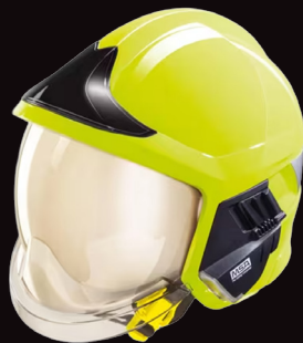
MSA Gallet F1 XF