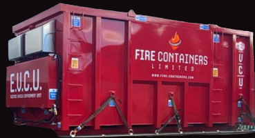
Electric Vehicle Containment Unit (E.V.C.U.)