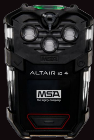
MSA Altair io4