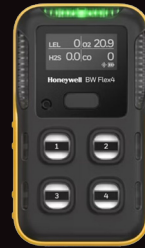
Honeywell BW Flex4