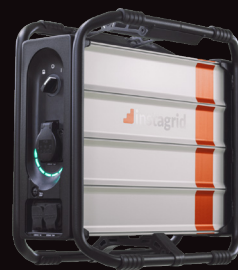
Instagrid ONE MAX