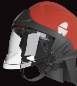
Pacific Haloflex F20 Structural