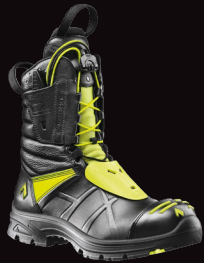
HAIX Fire Eagle Structural