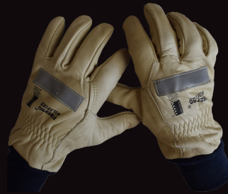
Firepro Wildfire Level 1