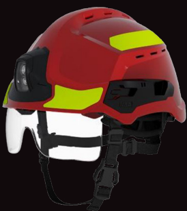
MSA Gallet F2XR