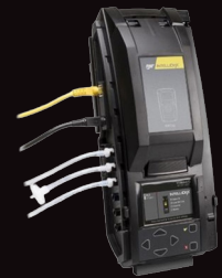
Honeywell IntellidoX Docking Station