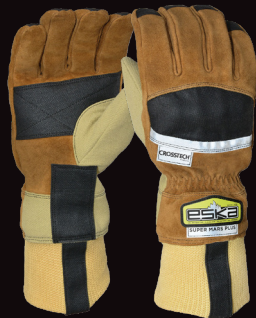
ESKA Supermars Plus Structural