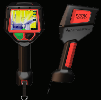
Seek Thermal AttackPRO NFPA