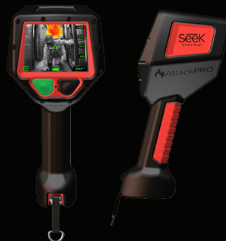
Seek Thermal AttackPRO VRS