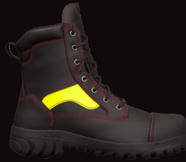
Oliver Wildland Lace-Up