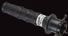
TFT Foam Tube