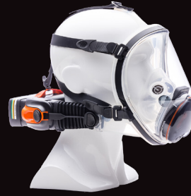
CleanSpace Ultra Full-Face Mask