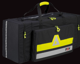
PAX Firefighter Kit Bag