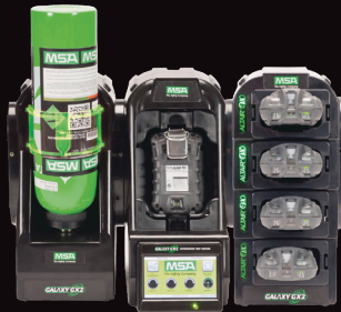
MSA Galaxy GX2 Test Station