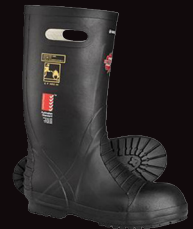
Skellerup Fire Fighter Extreme