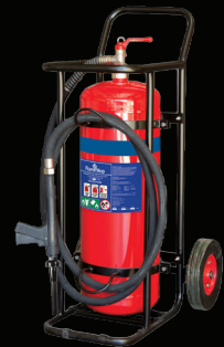
Foam Fire Extinguishers