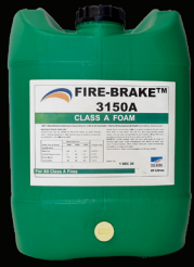
Solberg Fire-Brake Class A