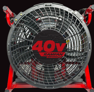
EX50Li DeWalt Milwaukee Makita