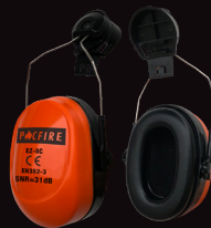
Fire Helmet Accessories and Replacements