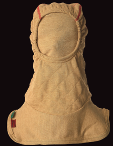
Bristol PBI Particulate Blocking