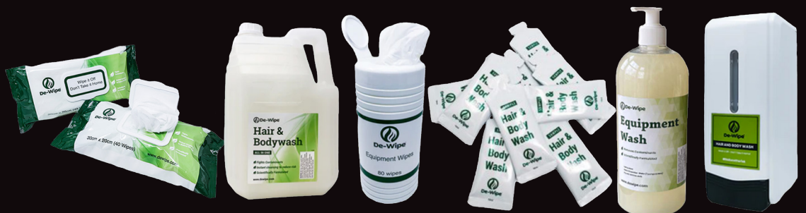
Dewipe Range: biodegradable wipes, equipment wipes/wash, hair and body wash