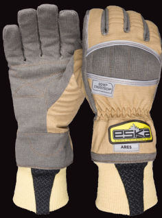
ESKA Ares Structural