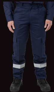
Stewart & Heaton T243 Wildand Trousers