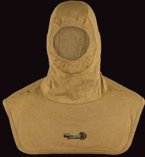
PGI BarriAire Gold