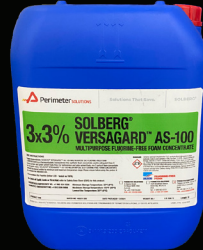
Solberg Versagard Class B